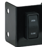
3014187 "Switch" & 3014188 "Bracket"