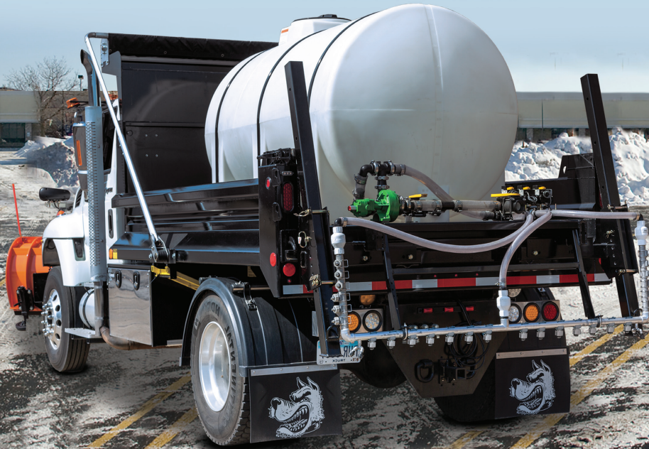
Hydraulic Systems - Powered by a 235 GPM hydraulic pump, with an oil requirement of 4-11 GPM