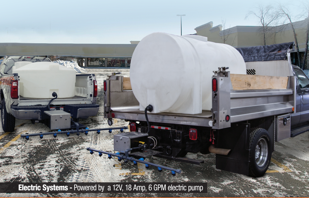
Electric Systems - Powered by a 12V, 18 Amp, 6 GPM electric pump