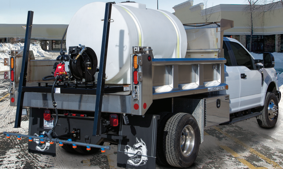
Gas Systems - Powered by Honda® engines: 5 HP for 185 GPM systems/2.8 HP for 25 GPM systems